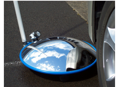
▶ With Base Light Option