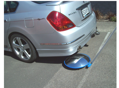
▶ Vehicle Bomb Inspection