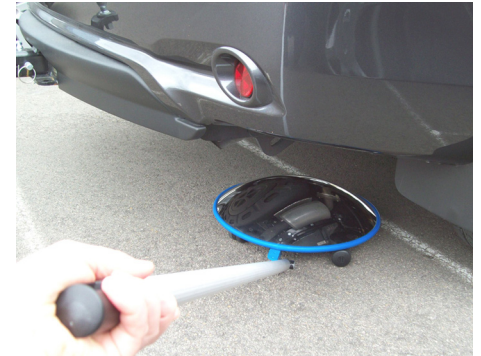
▶ Wide Angle View