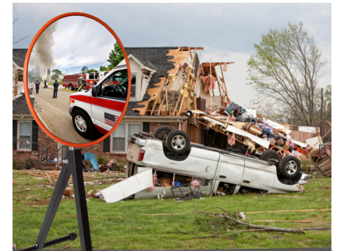
▶ Portable Emergency Response