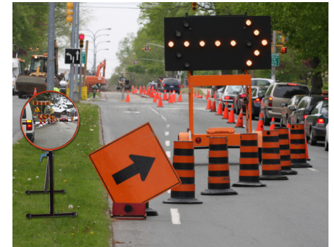
▶ Portable Road Side Safety