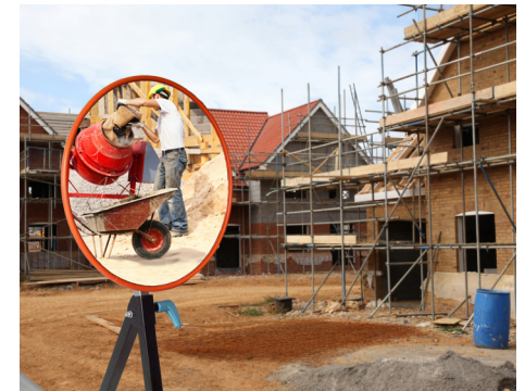
▶ Temporary Construction Site