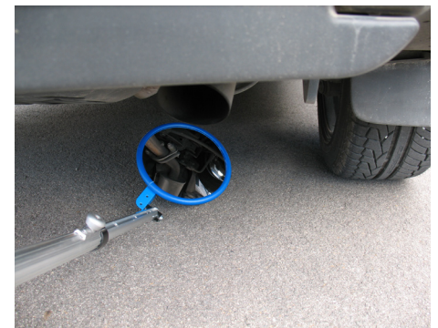
▶ Bomb Inspection