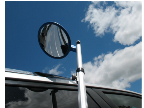
▶ Vehicle Inspection