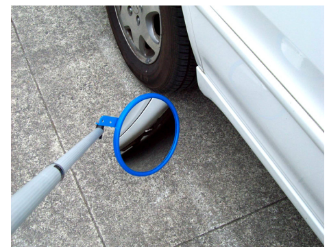
▶ Bomb Inspection