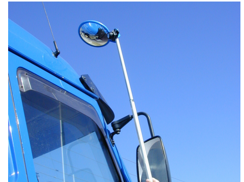
▶ Vehicle Inspection