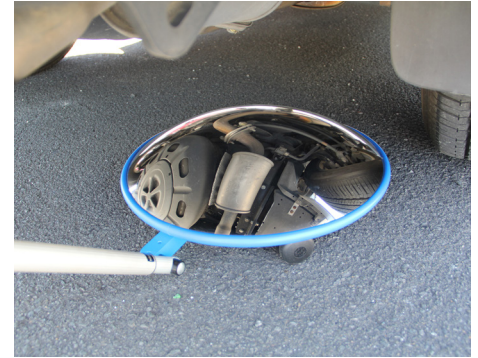
▶ Wide Angle View