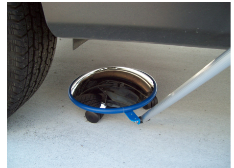
▶ Bomb Inspection