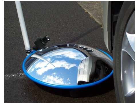
▶ With Optional Base-Light