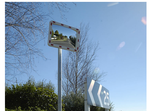
▶ Blind Corners