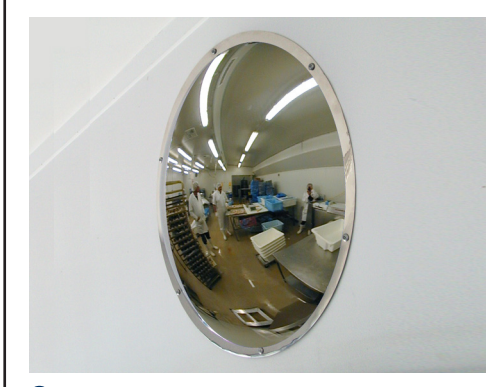
Wide Angle Reflection