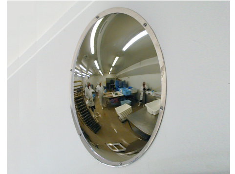
▶ Wide Angle Reflection