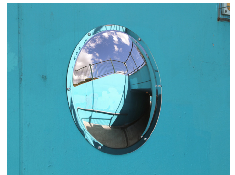
▶ Subways and Underpasses