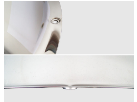
▶ Anti-Ligature Pressed Holes 16505C