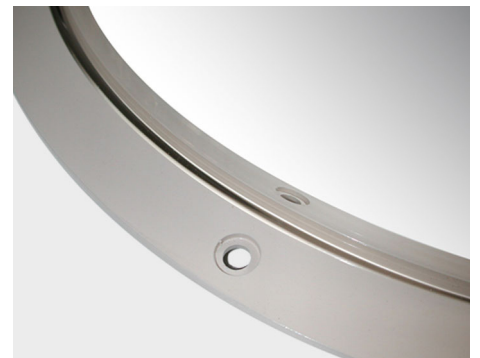
▶ Anti-Ligature Frame Holes 16505WD