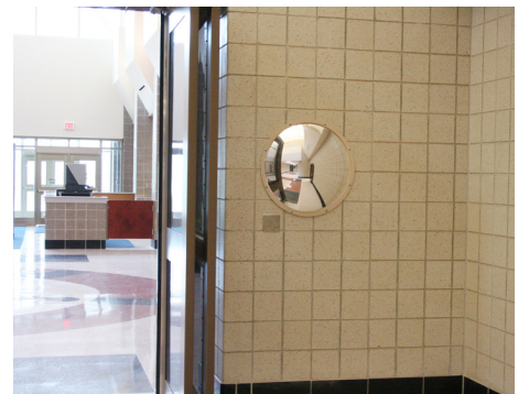
▶ Secure Area